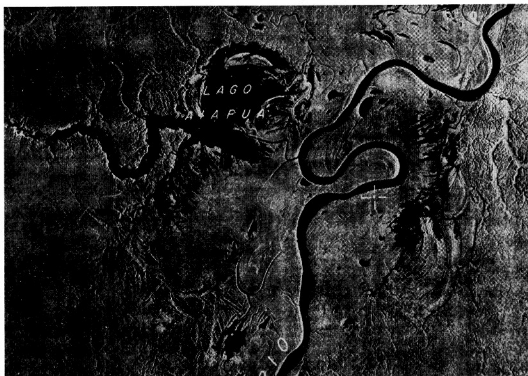
FIGURE 2 – Pleistocene Várzea – Lago Aiapuí on Rio Purus 80 km above its confluence with Rio Solimões. The “river-like” western part of Lago Aiapuí is the drowned valley of its affluent. North of this affluent the Pleistocene flood plain is best to be recognized. The ridges and swales are well developed. For scale: Lago Aiapuí has a N to S distance of 8 km.

extent of the floodplains with the areas studied. Nevertheless, it seems possible from our sedimentological and geochemical/mineralogical studies to establish the basic principles for the genesis of Pleistocene sedimentary deposition in the Amazonian Quaternary floodplains.